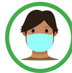
Fully covers the mouth and nose