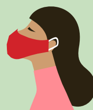
2-layer, Cotton Olson-style Mask