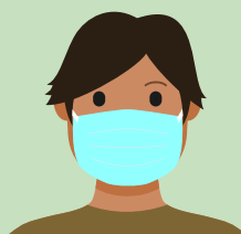
Single-Use Medical Mask