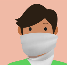
1-Layer Neck Scarf