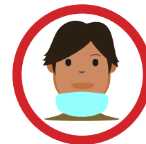
Does not cover mouth or nose