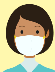
Fitted N95 Mask