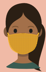
1-layer, Knitted or Beaded Mask