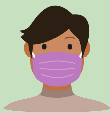
2-layer, Cotton Pleated Mask

Good protection. These masks block most germs from getting into the air.