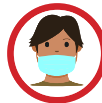
Does not cover nose